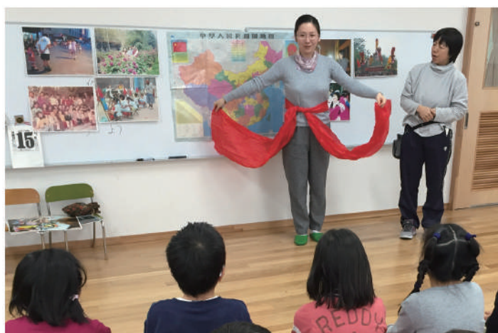
The Chinese lecturer demonstrated traditional dance.