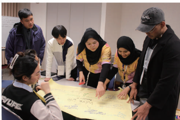
Discussion by participating youths of the Ship for Southeast Asian and Japanese Youth Program