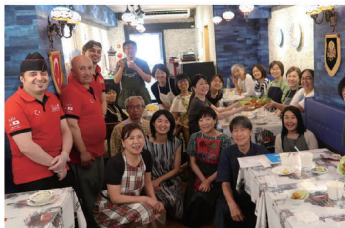
Cooking class with a chef of the Turkish restaurant.

Provide opportunities to experience various cultures, such as lectures, cooking classes and inspections to accept diversity. One of our programs focuses on Islamic culture.