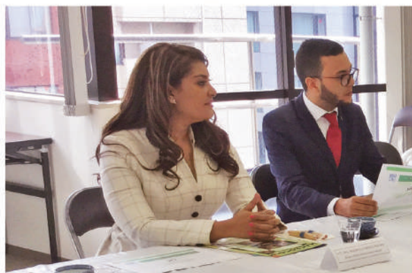
Ms. Balcáser, Minister of Youth in the Dominican Republic, visited CENTERYE.

Carry out surveys the previous participants of the International Youth Exchange Programs hosted by the Cabinet Office and build up a human network among them. In addition, we strengthen cooperation between various countries and people through exchange our views on international exchange.