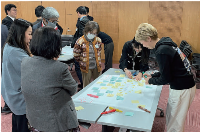
《Kyushu Block Event 2023 hosted by Oita IYEO》 Participants exchanged their own views on their activities and concerns.

Co-host the CENTERYE Forum for International Youth Exchange and the Block Events with IYEO.