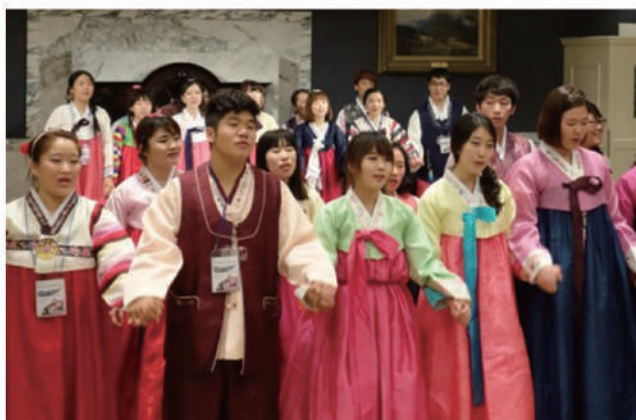
Welcome Reception of Japan - Korea Youth Friendship Exchange Program

Commissioned by the Cabinet Office, Government of Japan we have carried out the International Youth Exchange Programs. The programs are composed of the International Youth Development Exchange Program, the Ship for Southeast Asian and Japanese Youth Program, Japan-China Youth Friendship Exchange Program, Japan-Korea Youth Friendship Exchange Program, and the Ship for World Youth Program.