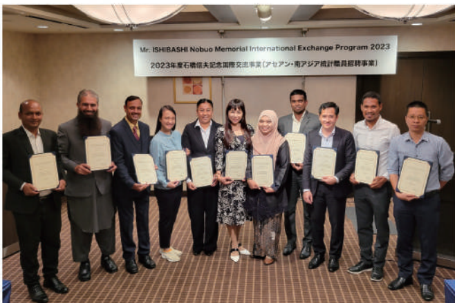
Statistical officials in Africa and Asia visit Japan and receive lectures in Tokyo and other areas for at least 10 days.

The Statistical Information Institute for Consulting and Analysis, abbreviated to Sinfonica, hosts the programs with the aim of human resource development in the field of official statistics in the countries of Africa and Asia since 2022.