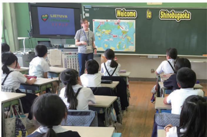
The Lithuanian lecturer introducing their culture.