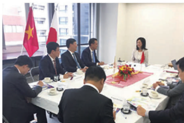
The delegation of Ho Chi Minh Communist Youth Union visited CENTERYE.