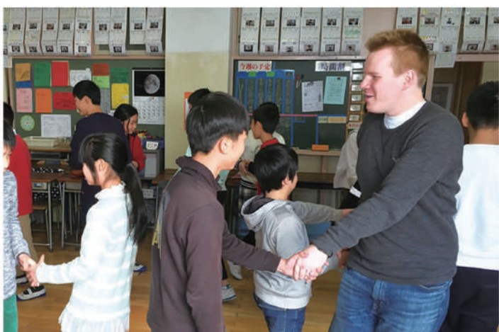
The Estonian lecturer taught Estonian dance.

We send people both from Japan and overseas who are passionate about education for international understanding to schools in Japan, and they give classes to promote international understanding. Our experienced staff coordinate the program based on the client's request, such as selection of lecturers, consultation of program planning and preparation of materials.