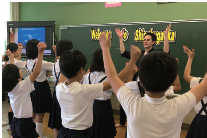
The New Zealand lecturer taught Haka, a variety of ceremonial dances in Maori culture.