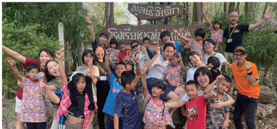
Participants of Study Tour to Thailand and local children

<Past Destinations> Thailand, South Korea, Uzbekistan, Malaysia, The Philippines