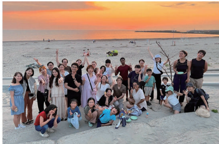
《International Exchange Tour by Yamagata IYEO》 Japanese and foreign people living in Yamagata took part in outside activities together and stayed one night.