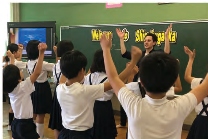
The New Zealand lecturer taught Haka, a variety of ceremonial dances in Maori culture.