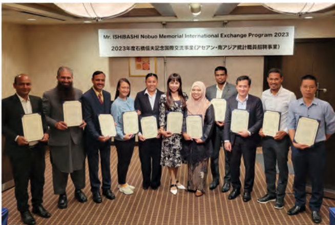
Statistical officials in Africa and Asia visit Japan and receive lectures in Tokyo and other areas for at least 10 days.

The Statistical Information Institute for Consulting and Analysis, abbreviated to Sinfonica, hosts the programs with the aim of human resource development in the field of official statistics in the countries of Africa and Asia since 2022.