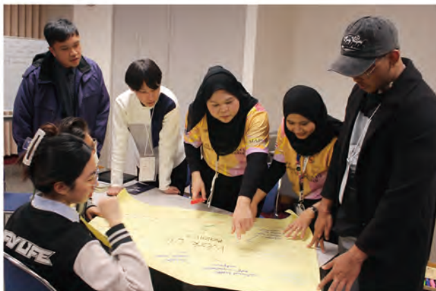
Discussion by participating youths of the Ship for Southeast Asian and Japanese Youth Program