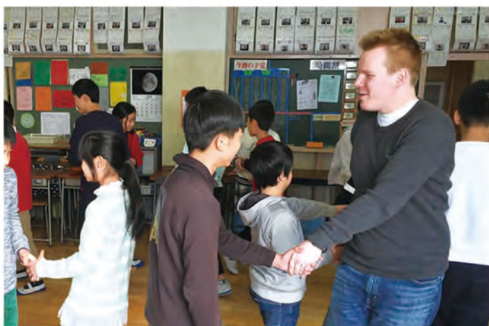
The Estonian lecturer taught Estonian dance.

We send people both from Japan and overseas who are passionate about education for international understanding to schools in Japan, and they give classes to promote international understanding. Our experienced staff coordinate the program based on the client's request,