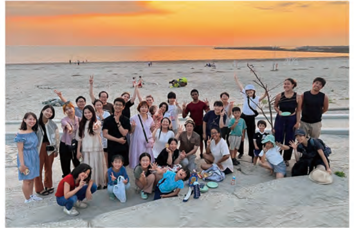
《International Exchange Tour by Yamagata IYEO》 Japanese and foreign people living in Yamagata took part in outside activities together and stayed one night.