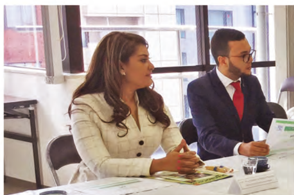
Ms. Balcáser, Minister of Youth in the Dominican Republic, visited CENTERYE.

Carry out surveys the previous participants of the International Youth Exchange Programs hosted by the Cabinet Office and build up a human network among them. In addition, we strengthen cooperation between various countries and people through exchange our views on international exchange.