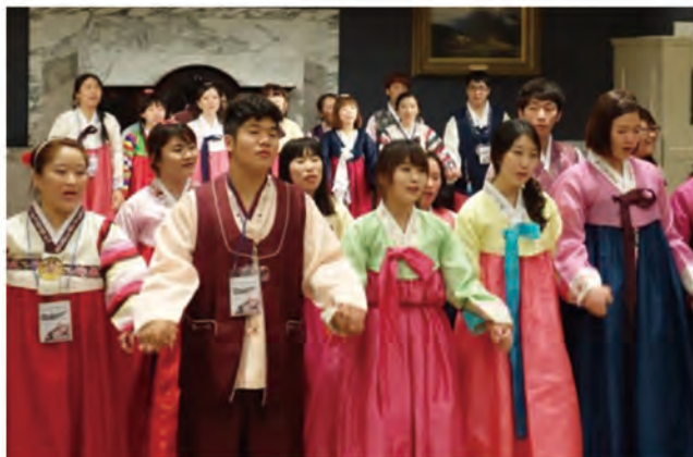
Welcome Reception of Japan - Korea Youth Friendship Exchange Program

Commissioned by the Cabinet Office, Government of Japan we have carried out the International Youth Exchange Programs. The programs are composed of the International Youth Development Exchange Program, the Ship for Southeast Asian and Japanese Youth Program, Japan-China Youth Friendship Exchange Program, Japan-Korea Youth Friendship Exchange Program, and the Ship for World Youth Program.