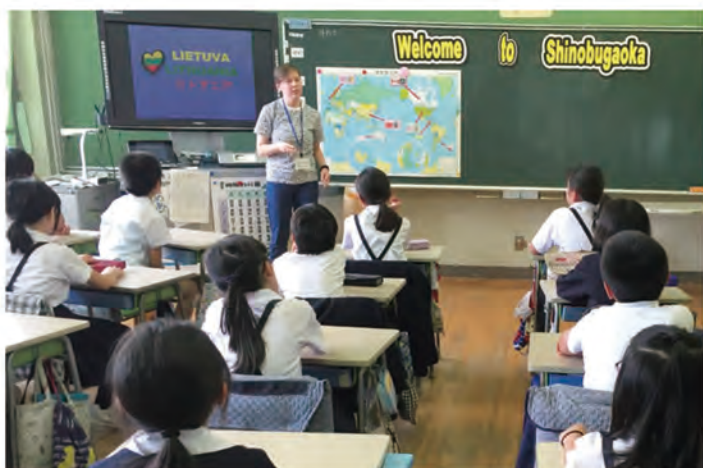
The Lithuanian lecturer introducing their culture.