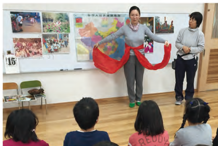
The Chinese lecturer demonstrated traditional dance.