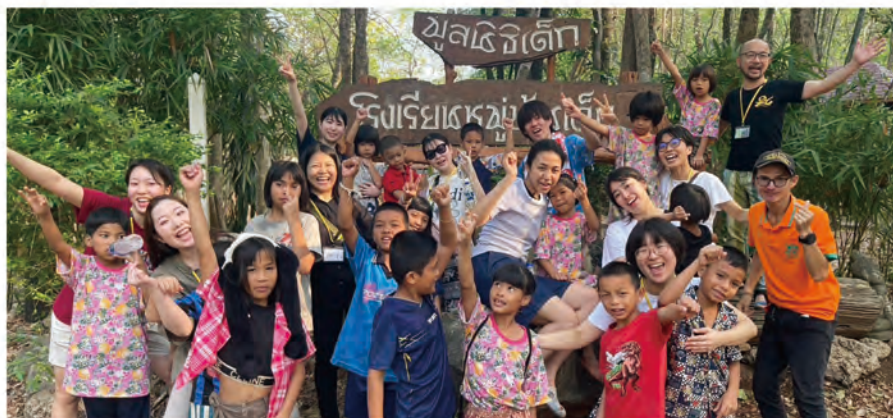
Participants of Study Tour to Thailand and local children

<Past Destinations> Thailand, South Korea, Uzbekistan, Malaysia, The Philippines