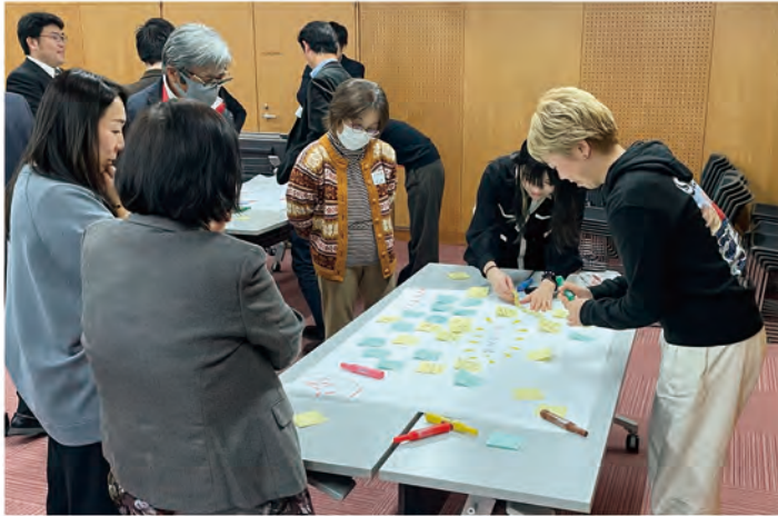
《Kyushu Block Event 2023 hosted by Oita IYEO》 Participants exchanged their own views on their activities and concerns.

Co-host the CENTERYE Forum for International Youth Exchange and the Block Events with IYEO.